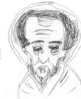
ST. JOSEPH BY E.O. 7Y.O.