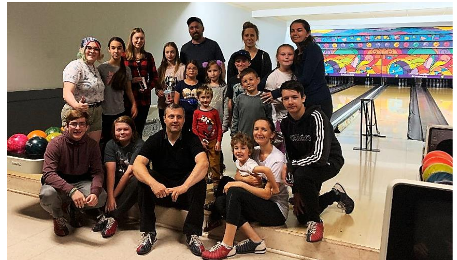
BOWLING & GOLFING WITH OUR YOUTH CHOIR. A WAY TO SAY THANK YOU FOR THEIR PRESENCE AMONG US AND THEIR ANGELIC SINGING.

◆ HELP OUR CHILDREN TO GO TO CAMP - Dear parishioners we are looking for your financial support to send the children of our youth choir to the Camp Morice (Fort St. James). Let's show our youngest parishioners how much we appreciate their presence among us and their angelic singing. The donation box you'll find in the foyer of the church.