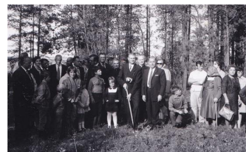
TURNING THE FIRST SOD, SEPTEMBER 27, 1970